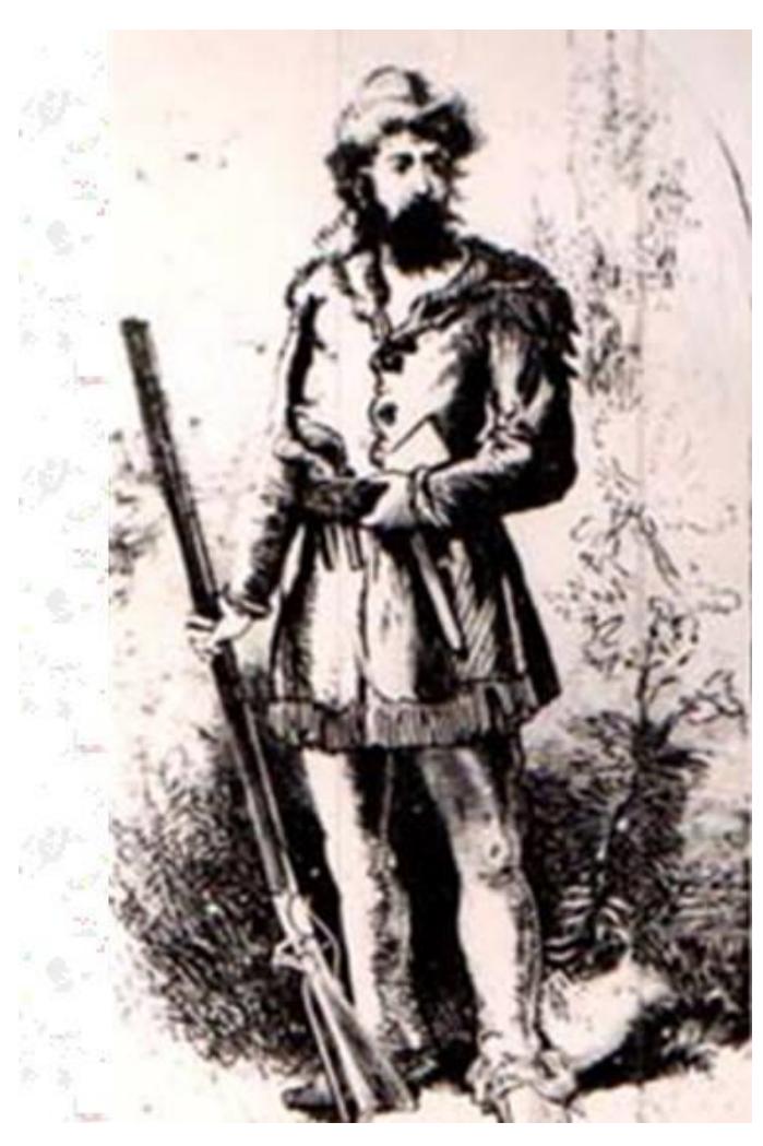
Researched By Roslyn Torella January 2014